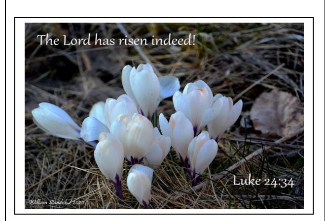
Crocuses in Spring remind us that what once appeared as death gives rise to new and hopeful life.

This photo reminds born again ones of the genuine confidence we have because we are in Christ and He is in us. Blessed opportunity because of His Resurrection.